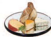
Model #274 Round