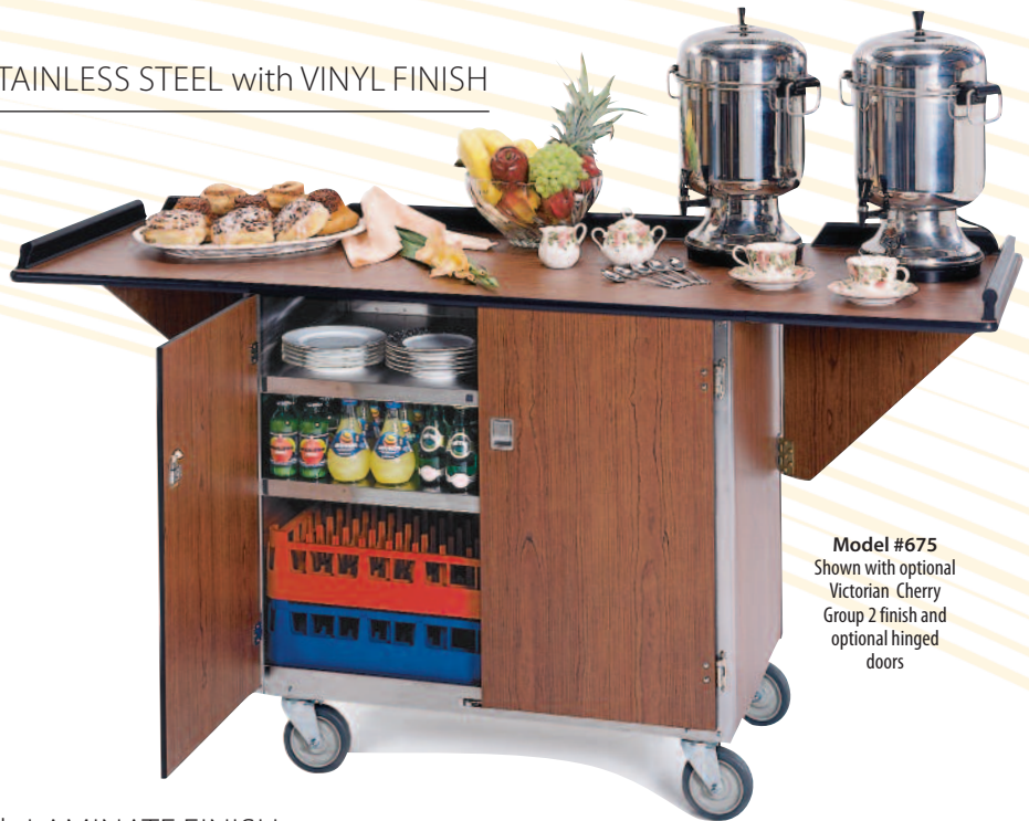
Model #675 Shown with optional Victorian Cherry Group 2 finish and optional hinged doors