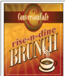
Merchandising panels on the front and overshelf are available to help you sell.