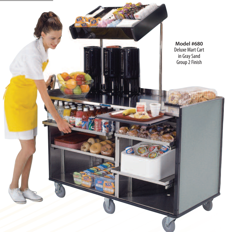
Model #680 Deluxe Mart Cart in Gray Sand Group 2 Finish